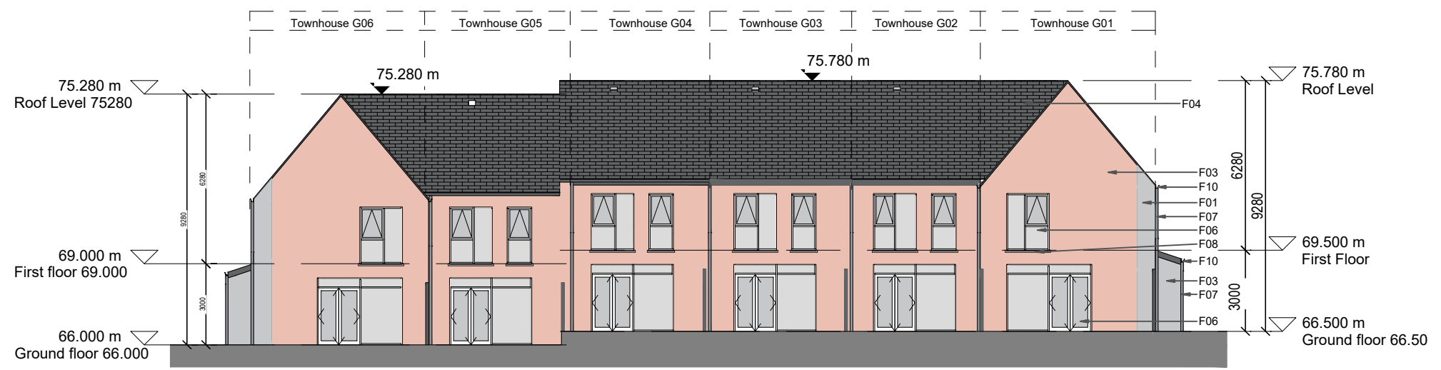
2 Rear Elevation (East) - Block G - Townhouse 1 : 200