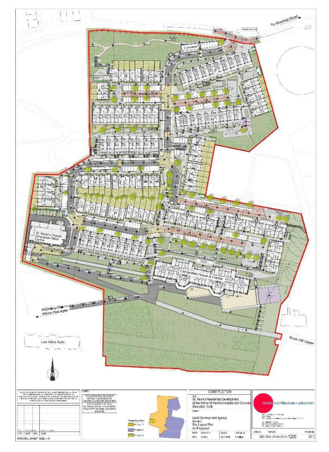
Figure 3 – Permitted development layout