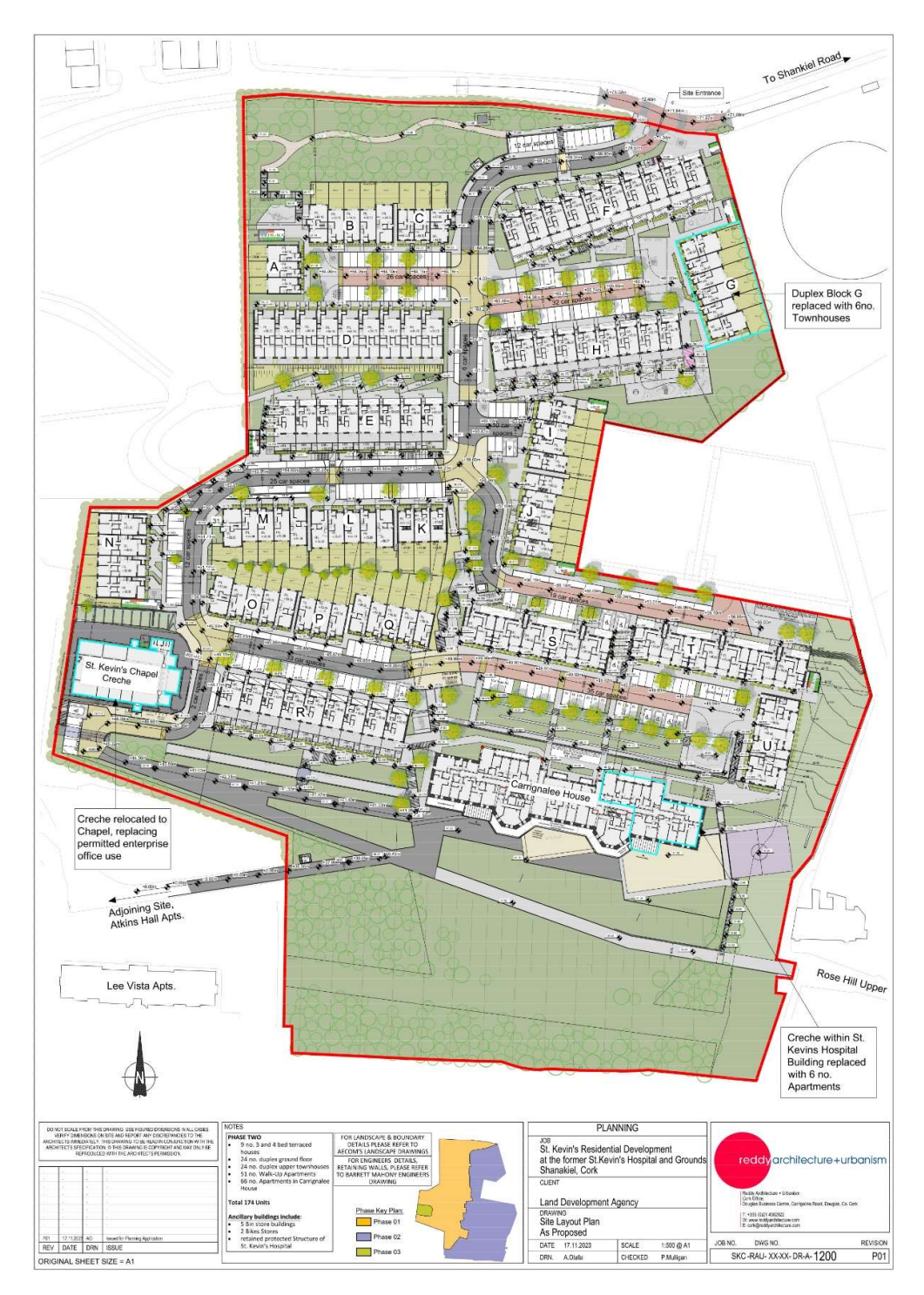
Figure 4 – Proposed changes to the permitted development