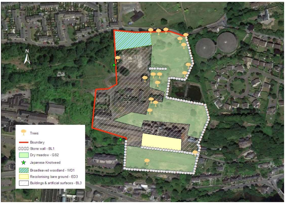
Figure 2 – Site location and habitats prior to construction

There are no other discharges from this development. Fresh water supply for the building will be via a mains supply. This originates from extraction points along the River Lee. There are no point air emissions from the site while some dust and noise can be expected during the construction phase.